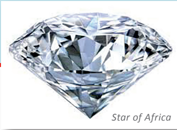
Star of Africa